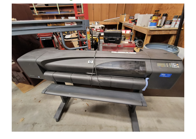
In The Student Center, Building