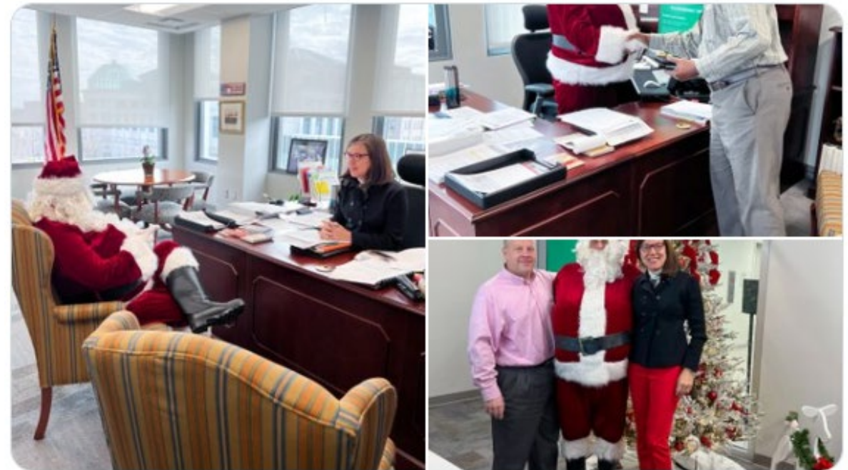
12:00 PM · Dec 22, 2022

DOA only recruits the best and brightest — and his skills make him a natural fit with our Mail Service Center — welcome to the team, Santa!