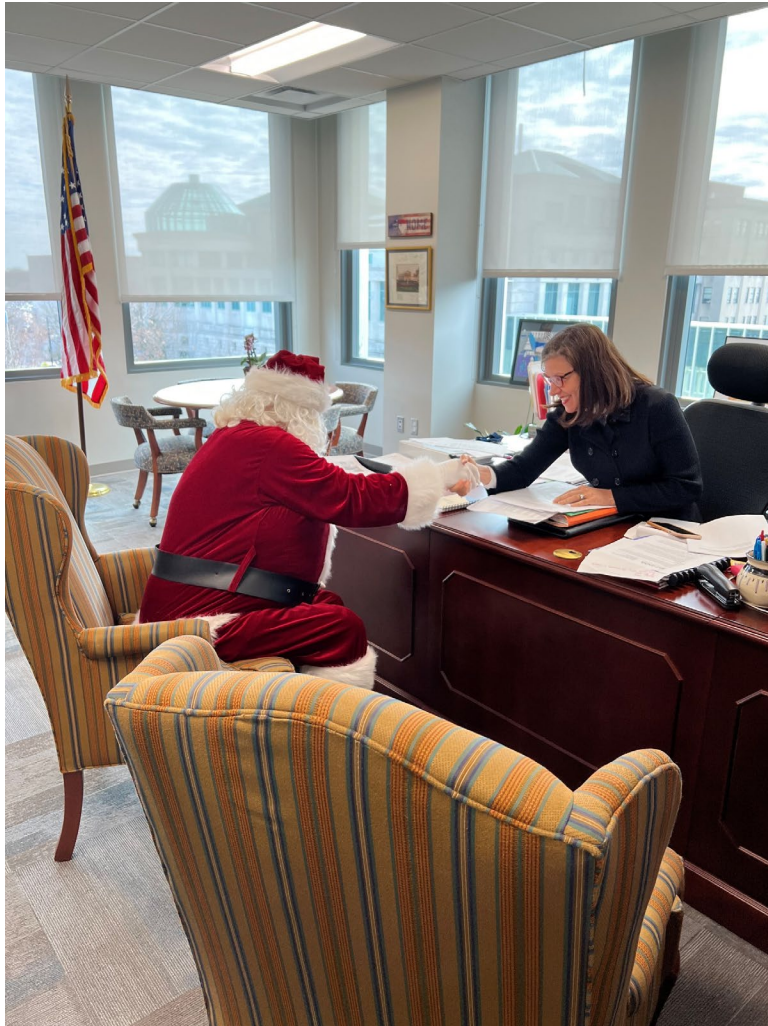
2023 State Construction Conference