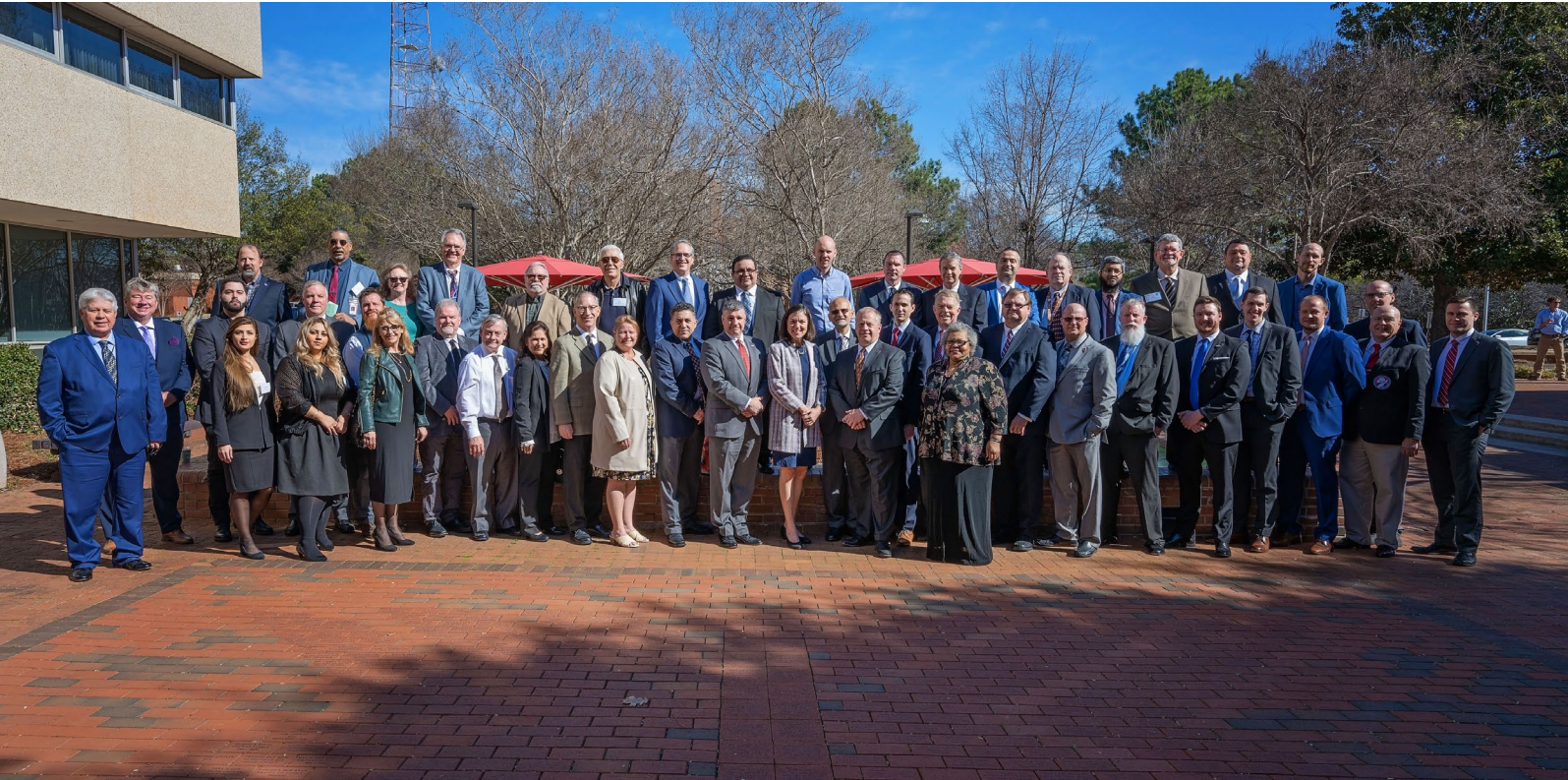
2023 State Construction Conference