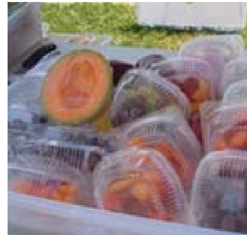
fresh fruit concession stand

Indian Tribe: The Tribe has developed a community garden adjacent to the Multipurpose Building with a walking trail, a Farmers' Market, an annual Corn Fall Festival, a youth garden in partnership with Hollister Elementary School, and a fresh fruit concession stand at the annual powwow. To learn more or to purchase a 2013 Haliwa-Saponi Farmers' Market calendar, please contact Karen L. Harley at 252-586-4017.