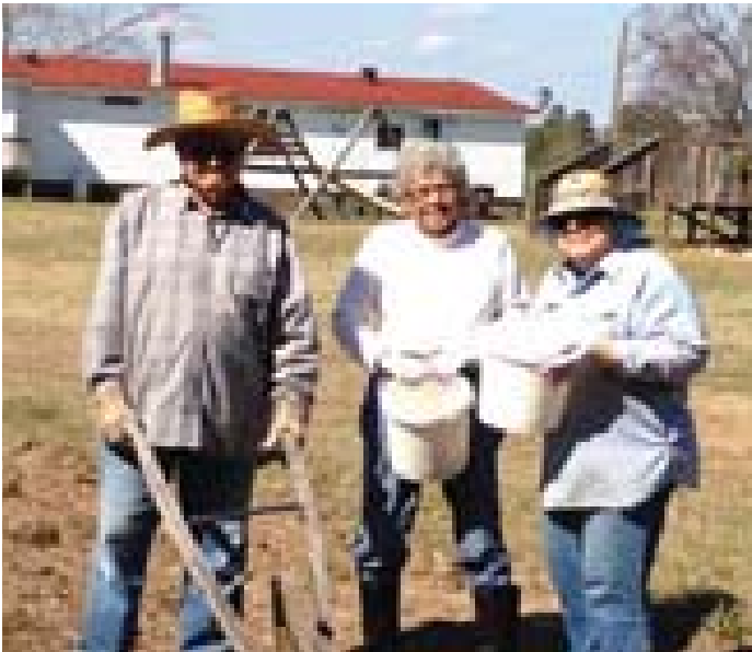
Elders from the Coharie garden community

Coharie Indian Tribe: The Tribe maintains a community garden at the Coharie Tribal Center, which is maintained by youth with the support of elders. Another garden maintained by elders is in Harnett County. In the Coharie way, the gardens inspire hard work and unity for the common good. The gardens encourage the community to stay physically active together and provide a space for elders to share their knowledge and experience with younger generations. To learn more, please contact Tabatha Brewer at 910-564-6909.