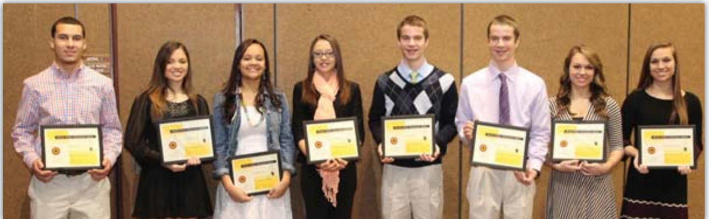
United Tribes Scholarship Recipients