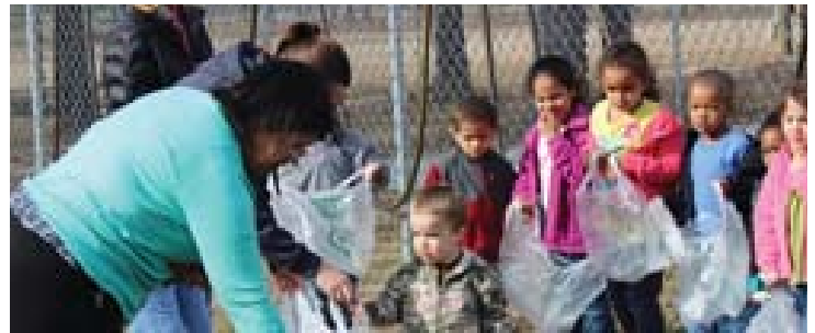
Youth aiding the fruit pop making process

The Tribe maintains a community garden, which also includes fruit trees on tribal grounds. Additionally, healthy collards and smaller-portioned Indian frybread are offered at the annual powwow. Fresh frozen fruit pops made by youth are gaining popularity and being sold as a healthy snack at softball games. Tribal member training and participation in the "Take the Lake" (walk/bike/swim-a-thon) is building each year. To learn more, please contact Brenda Moore at 910-655-8778.