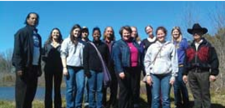
Meherrin Kitchen Renovators Team

Meherrin Indian Tribe: Kitchen renovations are underway as an empowering strategy for preparing healthy food for community gatherings instead of bringing in food from outside. This strengthens self-determination and encourages reinvestment in the community. The kitchen will provide space for the preparation of fresh fruits and vegetables required for 13 year-round traditional ceremonies. In addition, the Tribe is establishing a community garden, Farmers' Market and walking trail. To learn more, please contact Chief Wayne Brown at 252-209-0934.