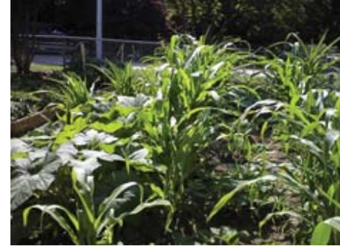
Members of the GNAA community garden group