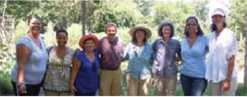
Members of the GNAA community garden group