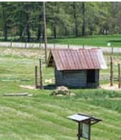
Tribal Farming Grounds

Meherrin Indian Tribe: Kitchen renovations are underway as an empowering strategy for preparing healthy food for community gatherings instead of bringing in food from outside. This strengthens self-determination and encourages reinvestment in the community. The kitchen will provide space for the preparation of fresh fruits and vegetables required for 13 year-round traditional ceremonies. In addition, the Tribe is establishing a community garden, Farmers' Market and walking trail. To learn more, please contact Chief Wayne Brown at 252-209-0934.