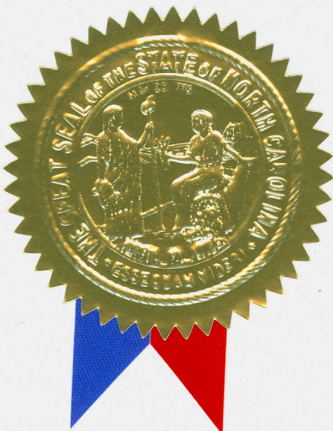
BEVERLY EAVES PERDUE

NOW, THEREFORE, I, BEVERLY EAVES PERDUE, Governor of the State of North Carolina, do hereby proclaim, August 2009, as “ MINORITY ENTERPRISE DEVELOPMENT MONTH ” in North Carolina and urge our citizens to celebrate the outstanding accomplishments made by minority-owned firms and to support minority business development.